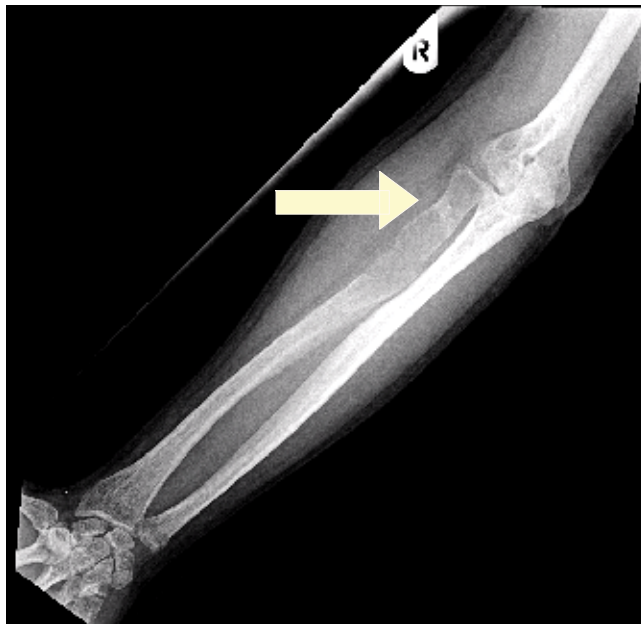
Figure 2: Radiograph of the right radius and ulna shows a lytic lesion at the proximal radius with a healing pathological fracture. (Arrow)

Subsequently, he was referred to an orthopaedic oncologist with the presumptive diagnosis of primary or metastatic bone malignancy. Core needle bone biopsy of the right radius showed features suggestive of osteo-