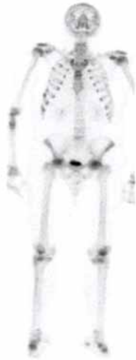
Figure 1: 99m Tc-methylene diphosphonate bone scintigraphy (anterior view) shows multiple abnormal foci of increased uptake. (Dark areas)