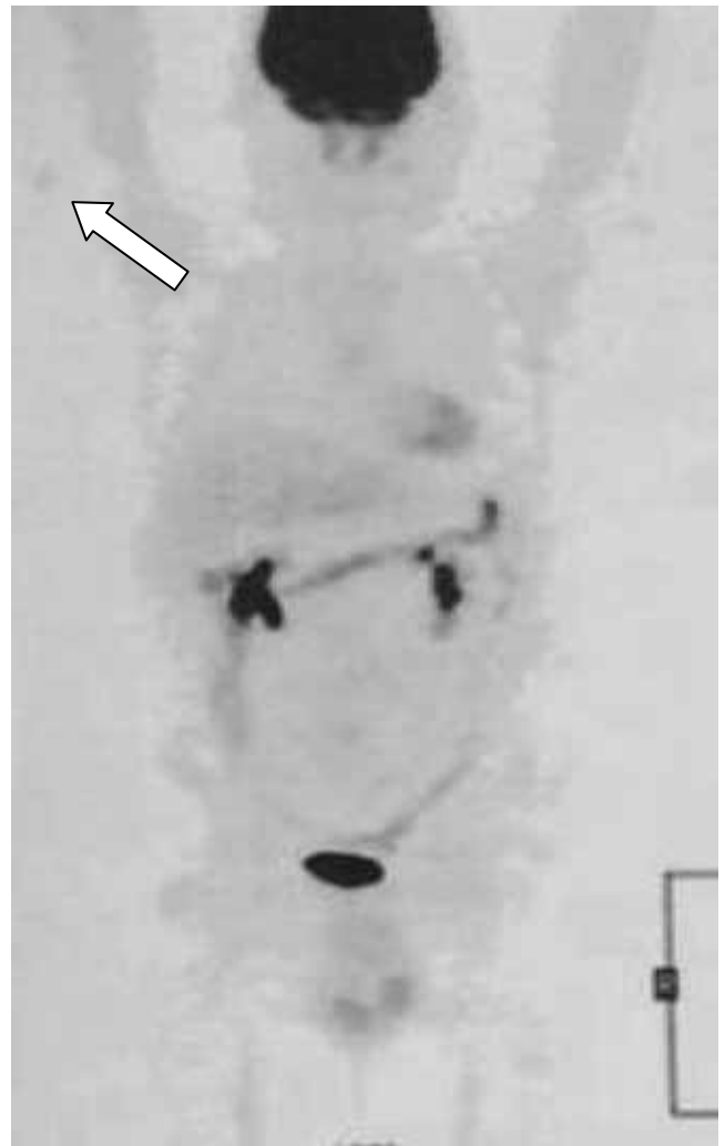
Figure 3: PET F-18-FDG coronal image shows abnormal increased uptake at the superior posterior aspect of the right arm. (Arrow)

McCance described a patient in 1947 whose vitamin D-resistant osteomalacia was cured by resection of a benign osteoid tumour of the femur (1). OOM is characterized by the biochemical profile of low serum phosphate, normal calcium, elevated ALP, low plasma 1, 25-dihydroxyvitamin-D, increased or inappropriate 24 hour urinary excretion of phosphate