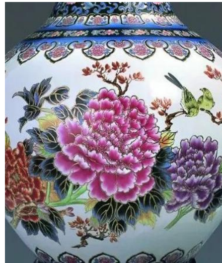
Figure 3 (Left): Lotus Motif – Chaozhou-Colored Porcelain Decoration by Master Chen Jian (Chaozhou, China)